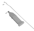
Pedal set for Magic bag holder