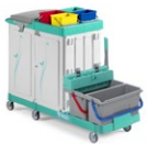
Magic Line 350E7