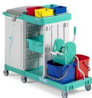
Magic Line 350P