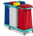
Magic Line 390S