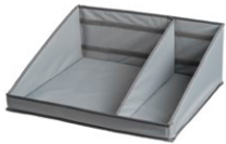
Divider Green Hotel