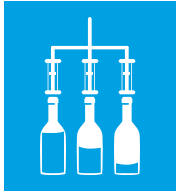
BOTTLING LINE & MICROFILTRATION SYSTEMS