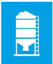
TANKS & CASKS