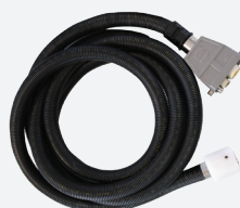
Bacchus foodgrade silicone hose 4m - 8m - 10m