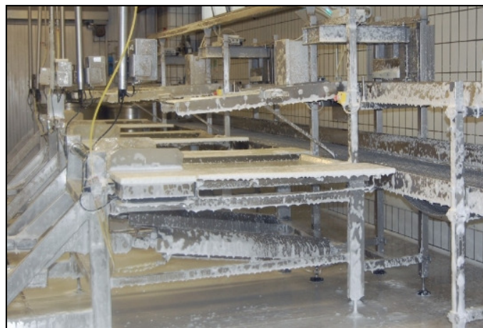
2 Chemical action